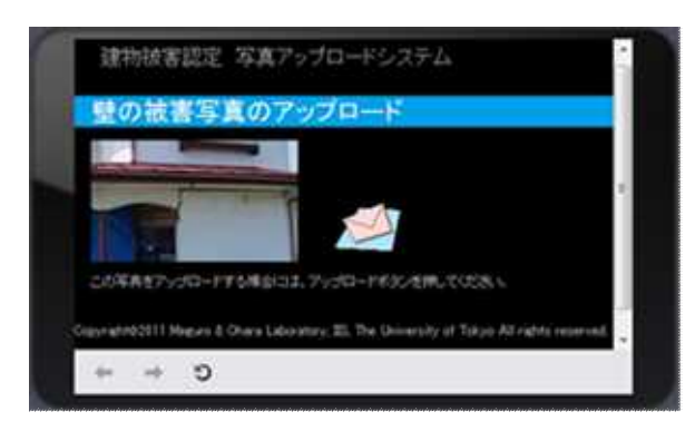
Fig. 4 Photo upload system in damaged area (upload page)