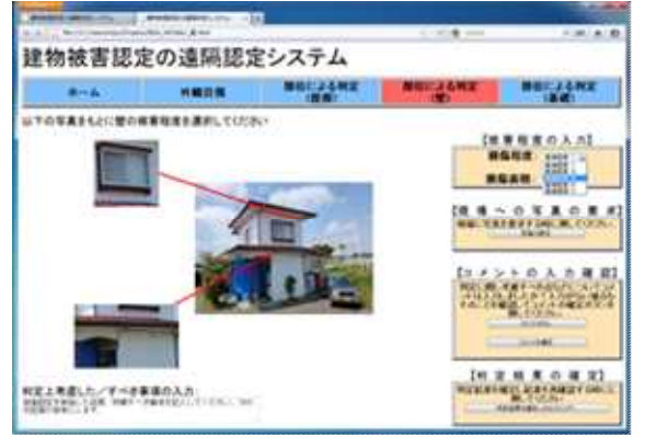
Fig. 6 Remote assessment system (overview assessment page)