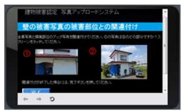
Fig. 5 Photo upload system in damaged area (relationship page)