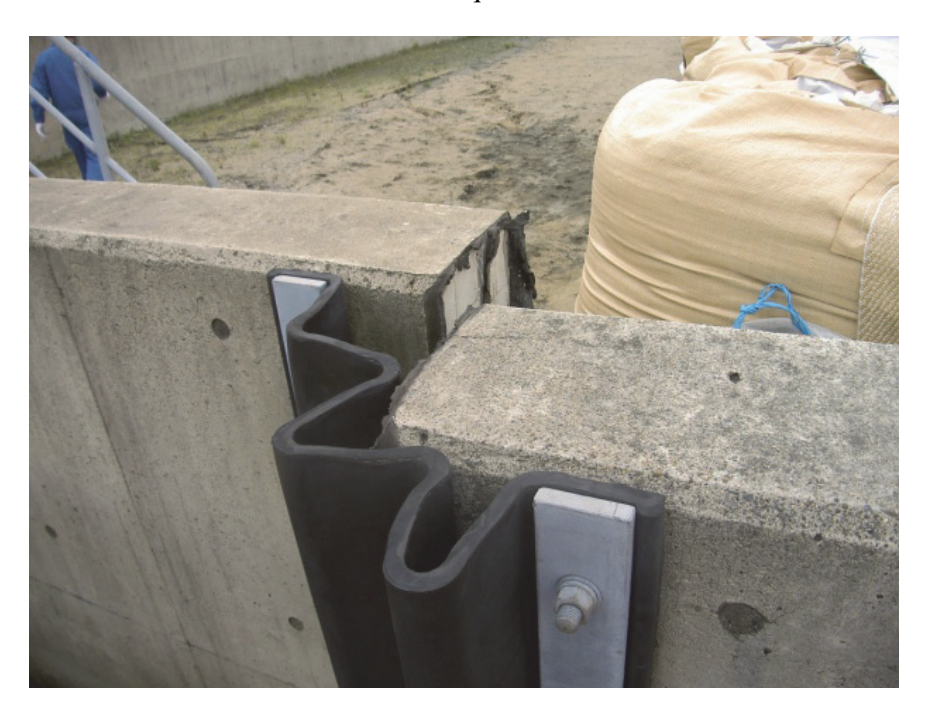
Photo 9 Fracture of wall joint of the dyke with rubber sheet protection