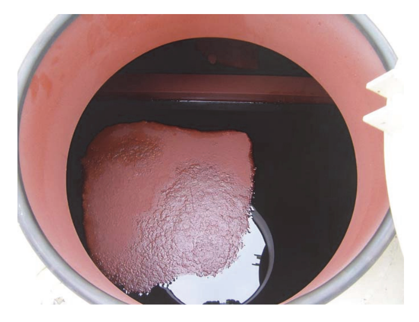
Photo 10 Crude oil leaked from the fracture part of pontoon of floating roof