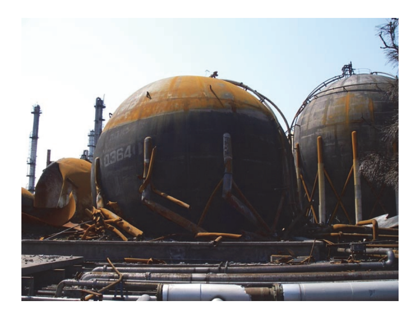
Photo 6 All legs of the LPG tank collapsed and buckled by the earthquake