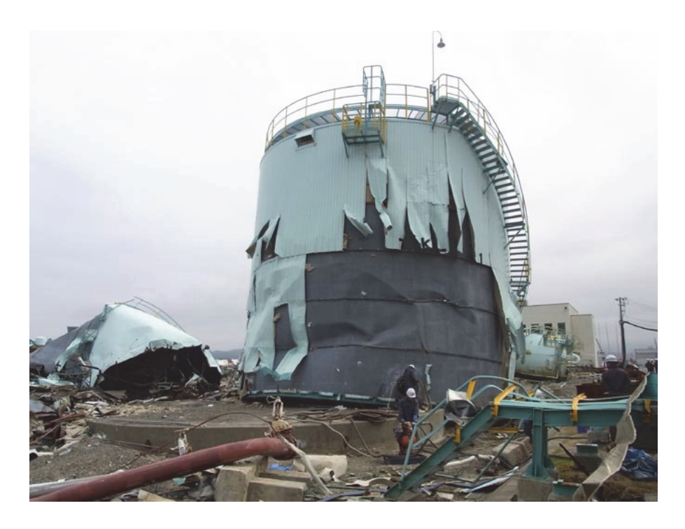
Photo 14 The tank of which the shell plate buckled and the heat reserving materials tore off