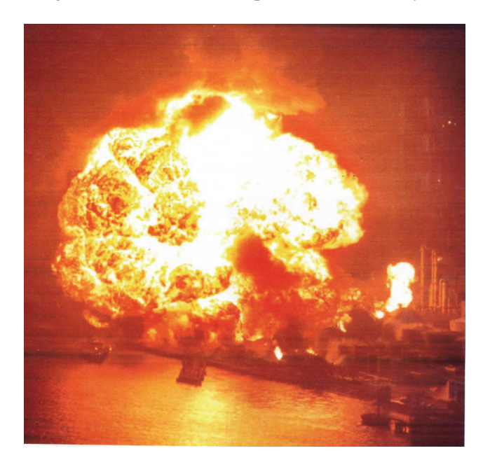
Photo 7 Largest fire ball in the fire with approximate 600m diameter